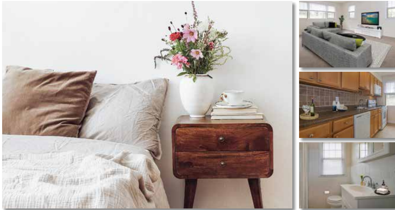
One Bedroom Junior 560 Square Feet