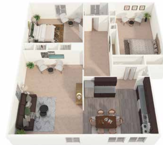
Two Bedroom 1,000 Square Feet

Elkins Park Gardens offers spacious one and two bedroom apartments. A delightful community with a host of amenities awaits you. Professional management and maintenance staff ensure the care free lifestyle that you expect in apartment home living.