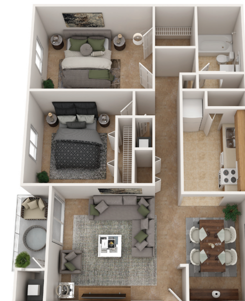
Two Bedroom 974 Square Feet

Floor plans not to scale. Details vary from residence to residence and are not necessarily built exactly as indicated above.